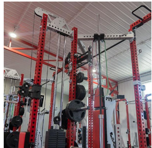
Machine only adds 23" to footprint