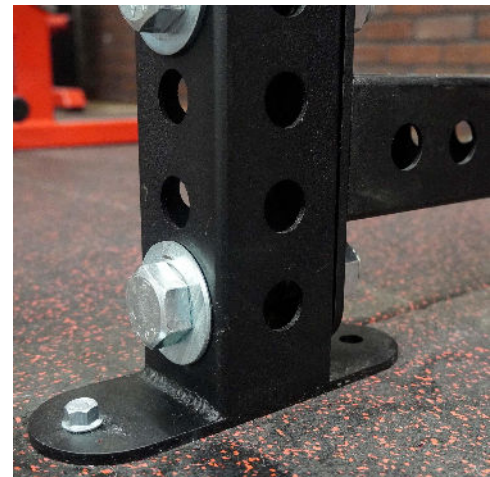
Bolt Down Tab