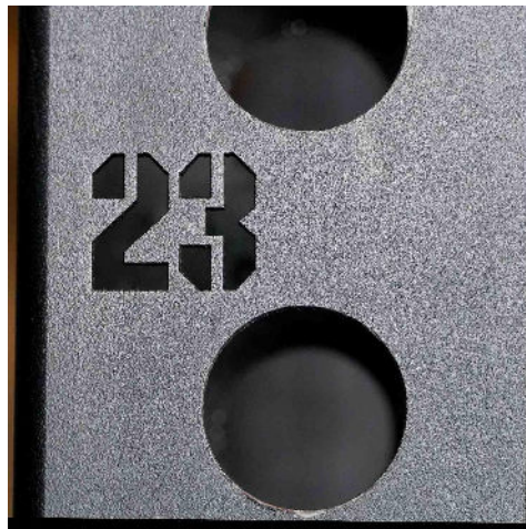
37 Numbered Holes