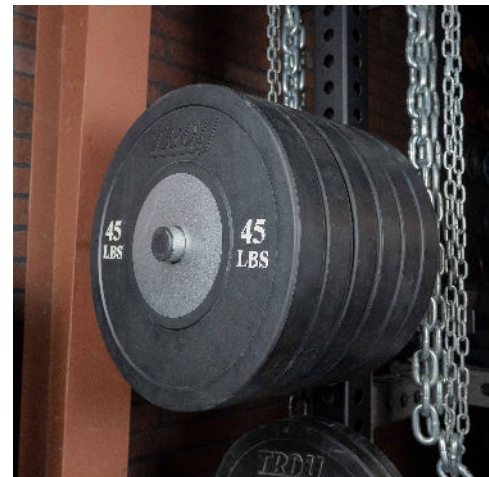
6 45 LBS Bumpers per Peg